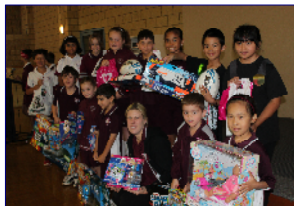
Here are our prize winners and congratulations once again!

Acting Leader of Learning Early Stage One